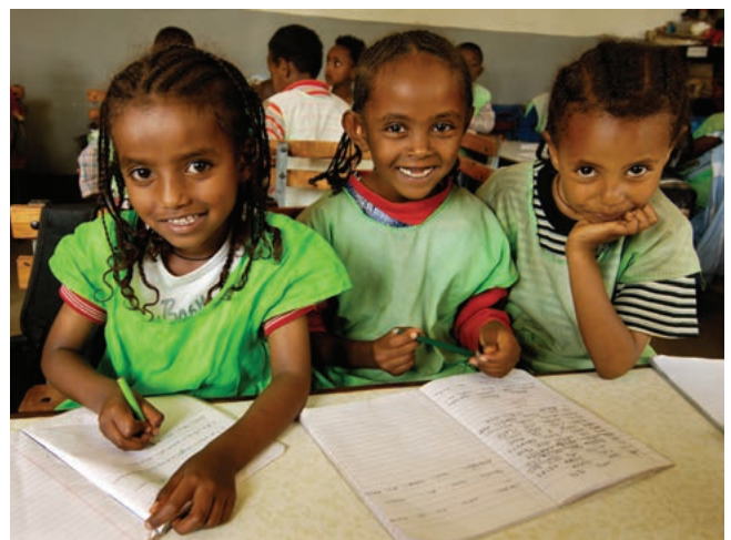
Children at a church-funded kindergarten.

The Ethiopian government has designed a national framework for ECCE (2010). Within this framework, the state would regulate existing private sector provision. It would also begin to provide low-cost ECCE programmes through extending existing government primary schools to provide a reception year. Where this is not possible, some older primary school pupils would be trained as Child-to-Child facilitators in a programme of play designed to improve the readiness of younger children to start school. But there is extremely limited government and donor funding available for the plans in the framework. The implementation of ECCE risks placing a significant burden on an already overstretched primary education system.